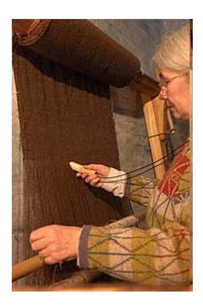
Weaving woollen sailcloth for one of the Oselver boats.

http://www.vikingeskibsmuseet.dk/index.php?id=1313&L=1