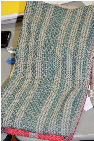
Sandi's latest towels