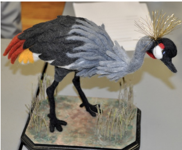
Goodie's needle felted crane