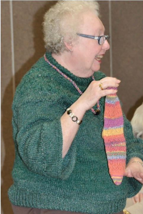
Selma's sock, hand knitted sweater & handmade necklace