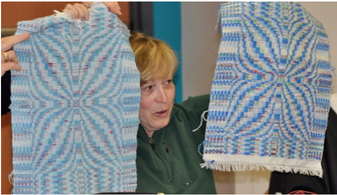
Micki P's "before & after wet finishing" overshoot from hand dyed yarn