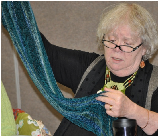
Natalie's chenille scarf with hand dyed yarn