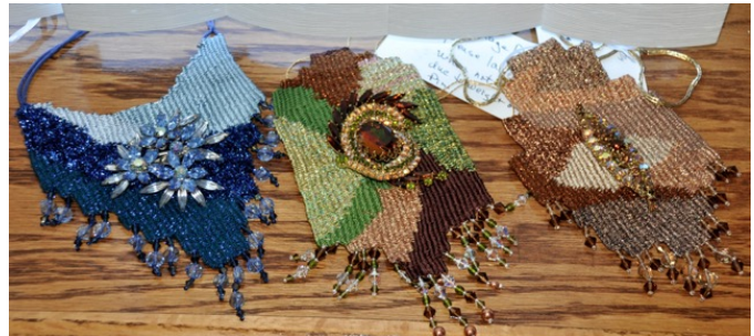
Examples of Micki's work