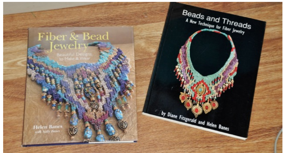
Micki's favorite needle weaving resources