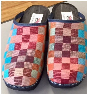
^ Judy's clogs & matching handwoven vest >