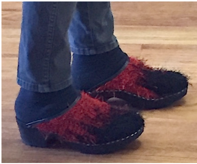
Judy's fuzzy clogs