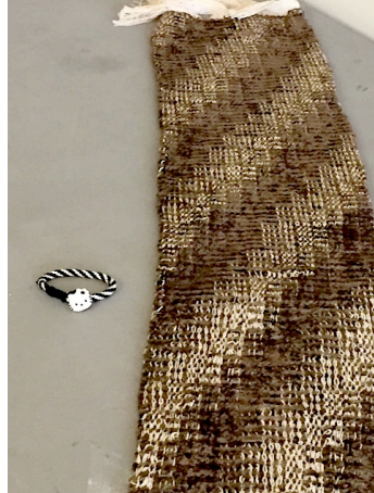
Sandi's WMBG wave scarf & kumihimo bracelet