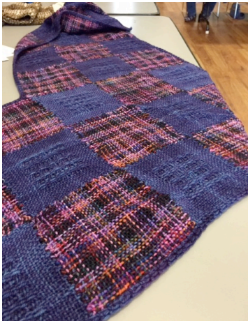
Ellen's pin loom scarf