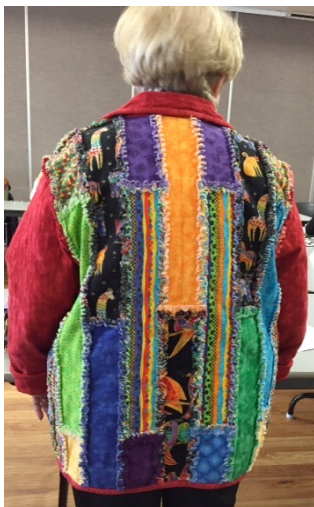
<<Micki P's jacket