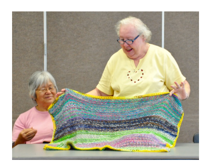
Selma's sock yarn afghan