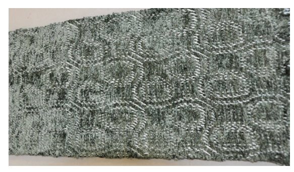
Kathy's "Big Twill" chenille scarf