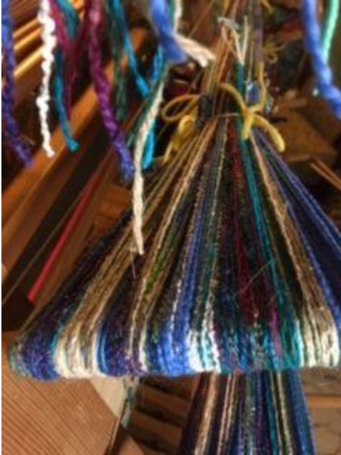
Janet planning bogg jacket colors!