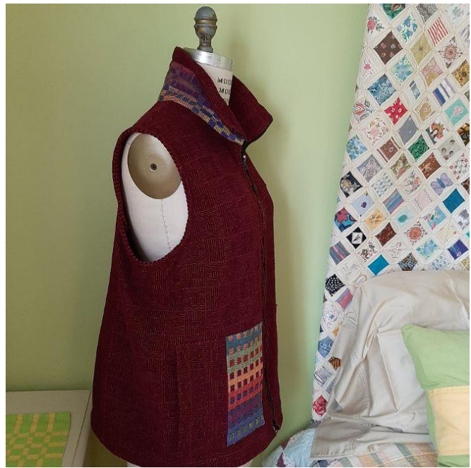
Diligent Sandi showing a hand-made vest and Oh-so-soft hand-spun alpaca wrap.