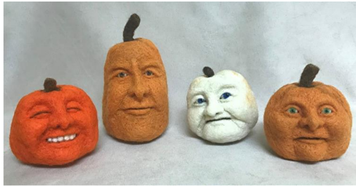
Industrious Goodie working on plarn bag and sculpted felt!