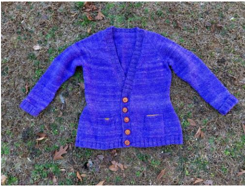
Lisa's adorable pattern called "Shapely boyfriend"